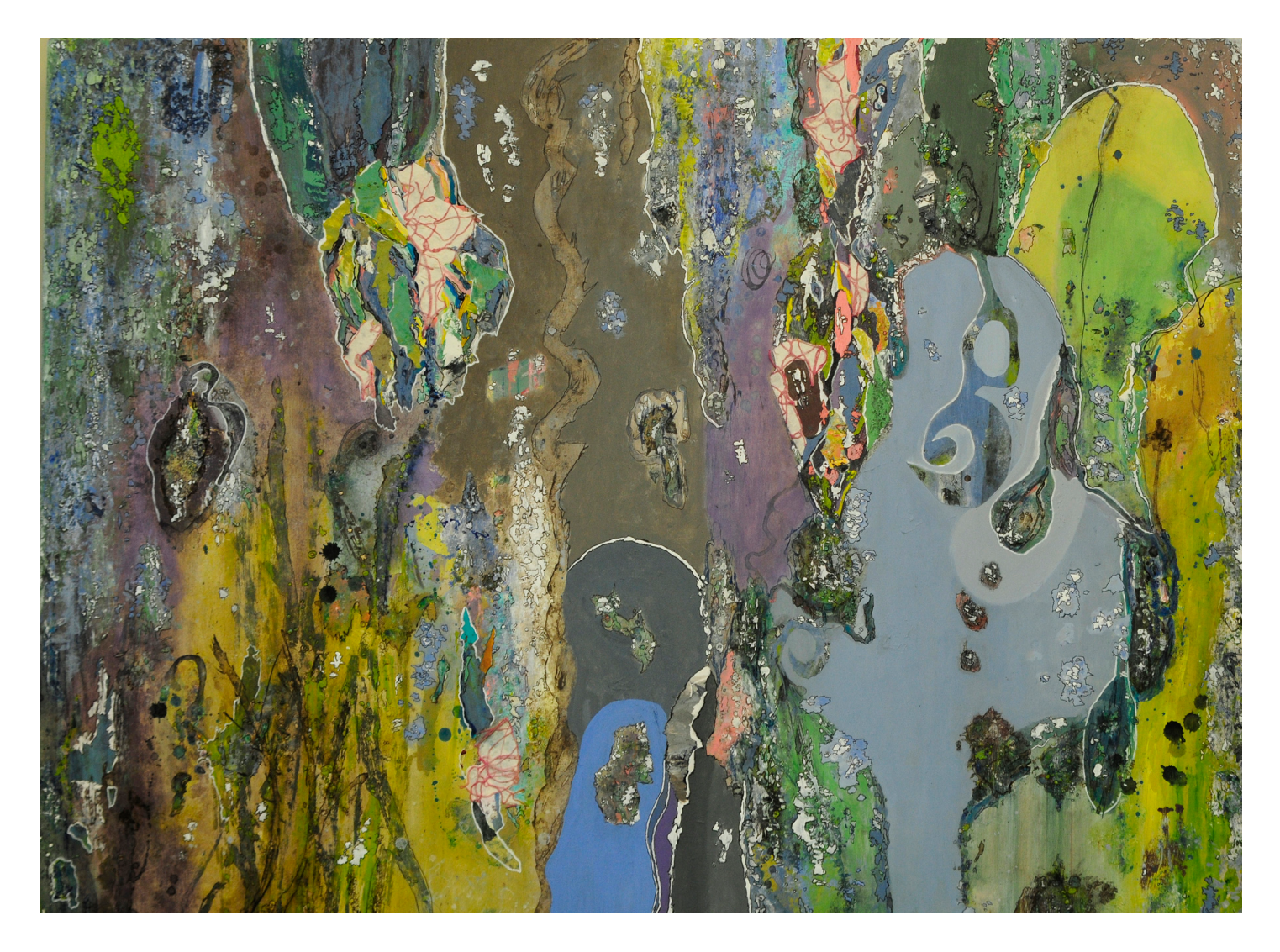
Ocean Breathes Salty 48" x 36" - acrylics, ink and mixed media on wood