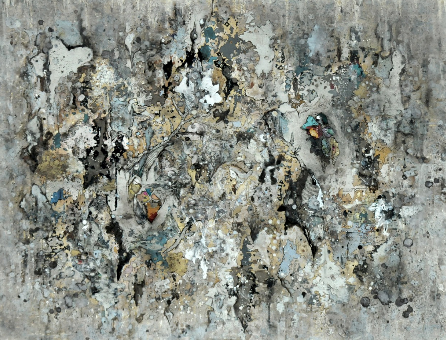
Expedition 48" x 36" - acrylics, ink and mixed media on wood