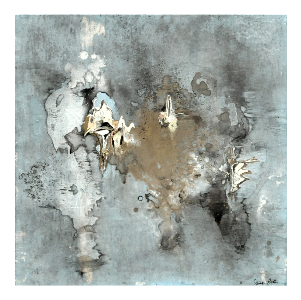
Cascade 24" x 24" - acrylics, ink and mixed media on wood