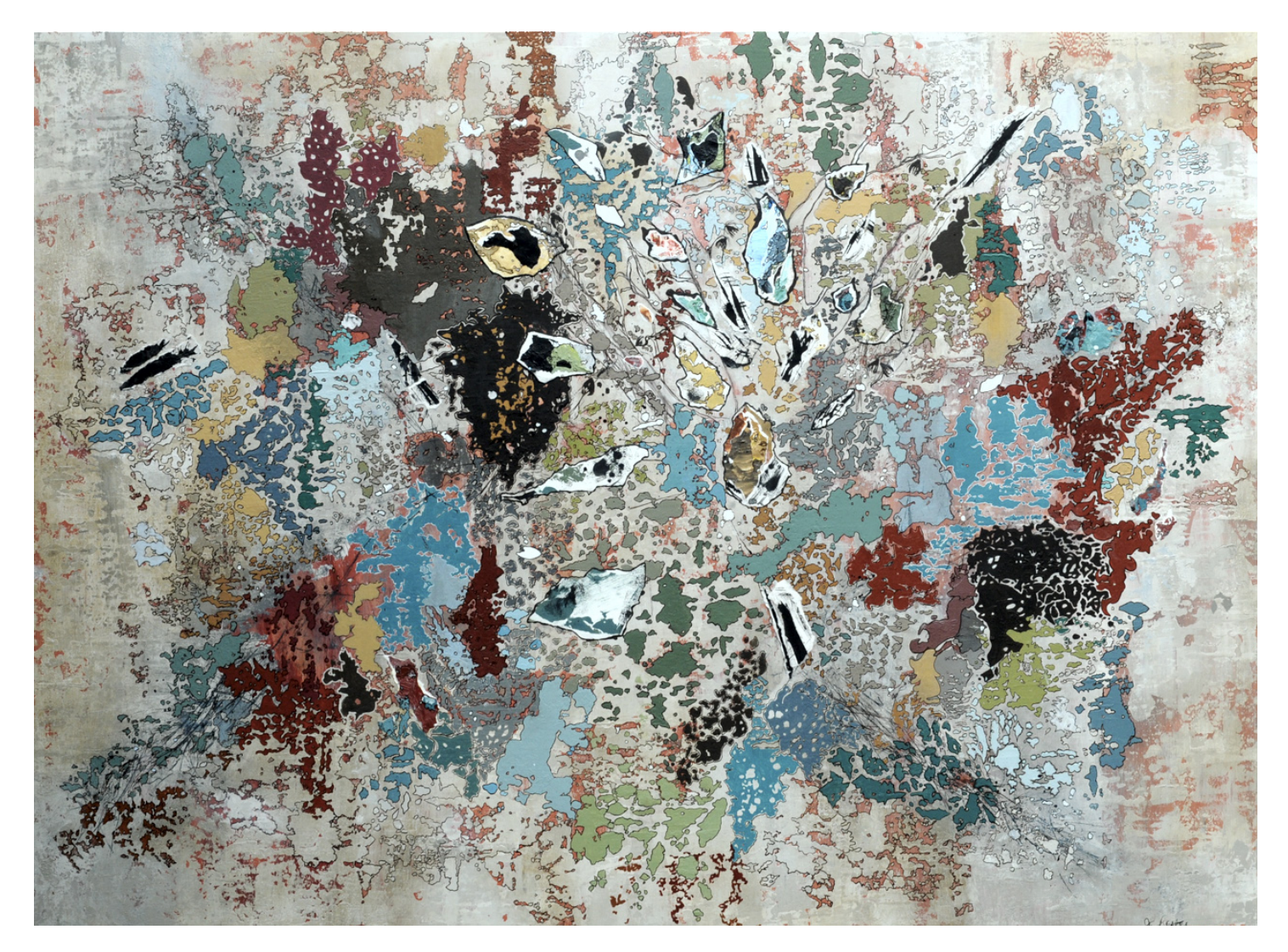
Days of Open Hand 48" x 36" - acrylics, ink and mixed media on wood