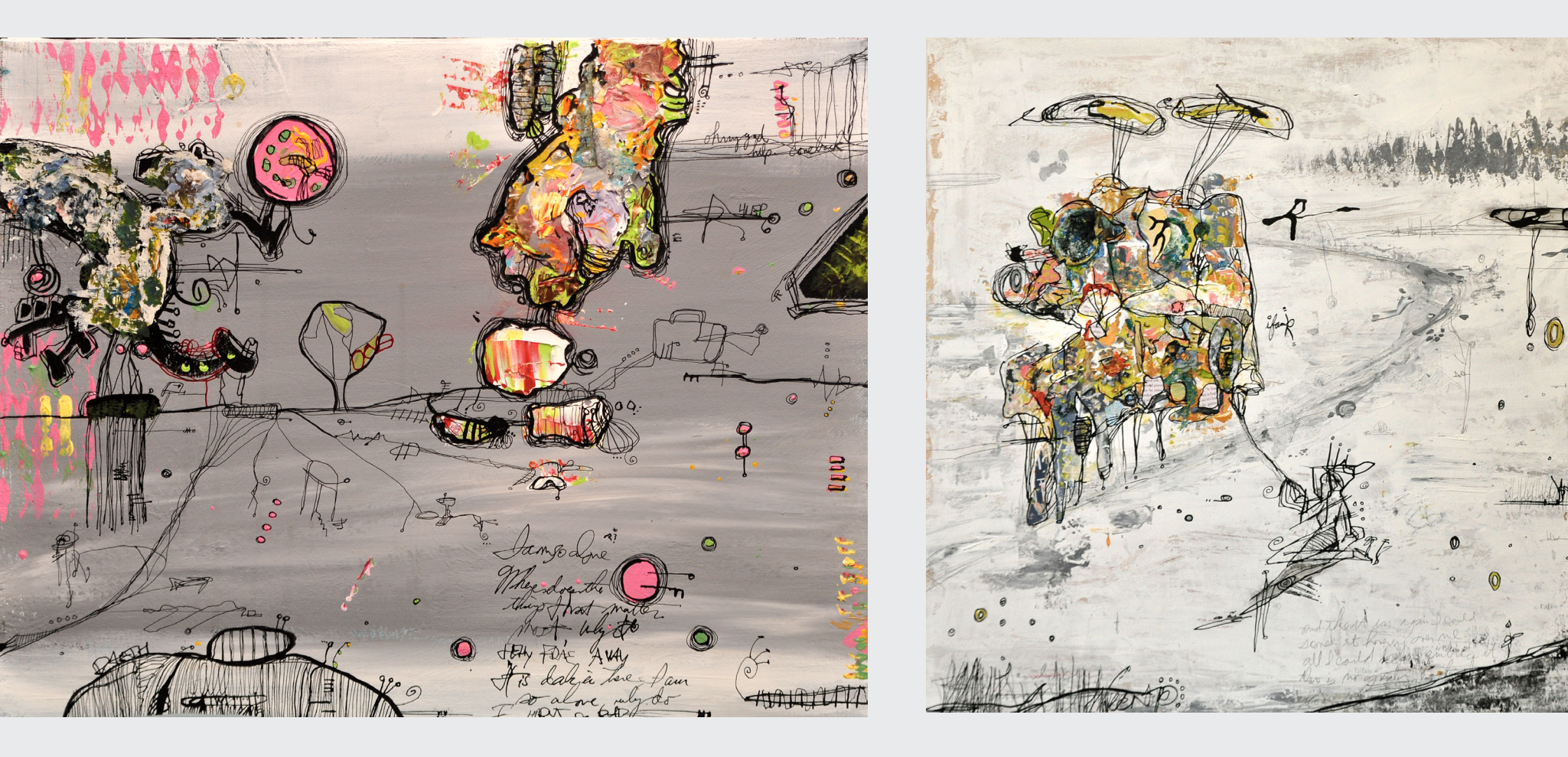
You're All I Need (left) 20" x 16" - acrylics, ink and mixed media on canvas

I Feel Loved (right) 24" x 24" - acrylics, ink and mixed media on wood