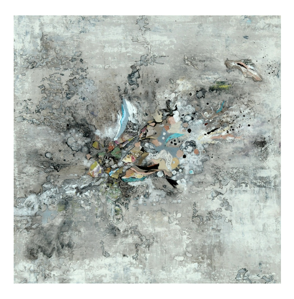
Burst 24" x 24" - acrylics, ink and mixed media on wood