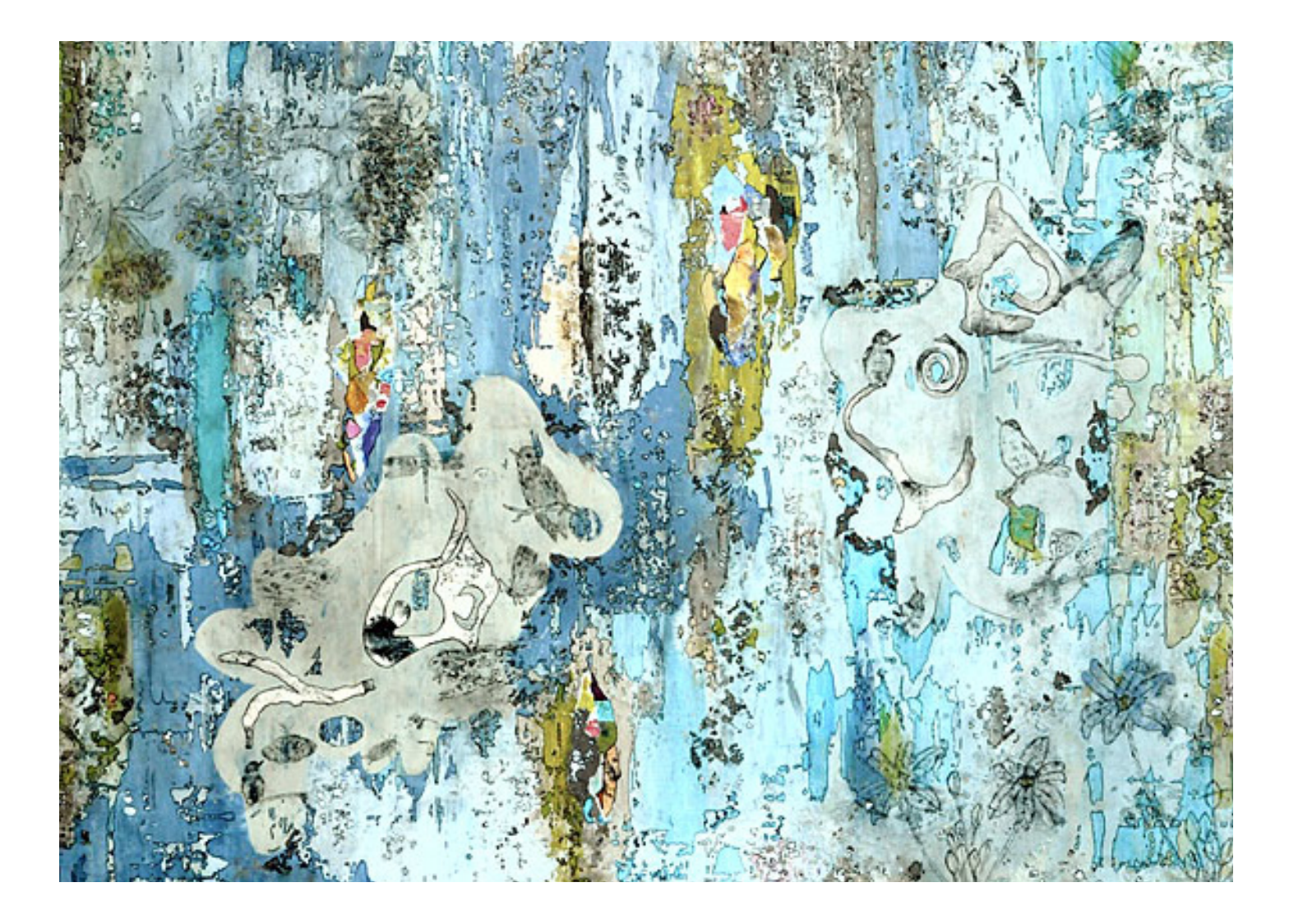
Fade Into You 48" x 36" - acrylics, ink and mixed media on wood