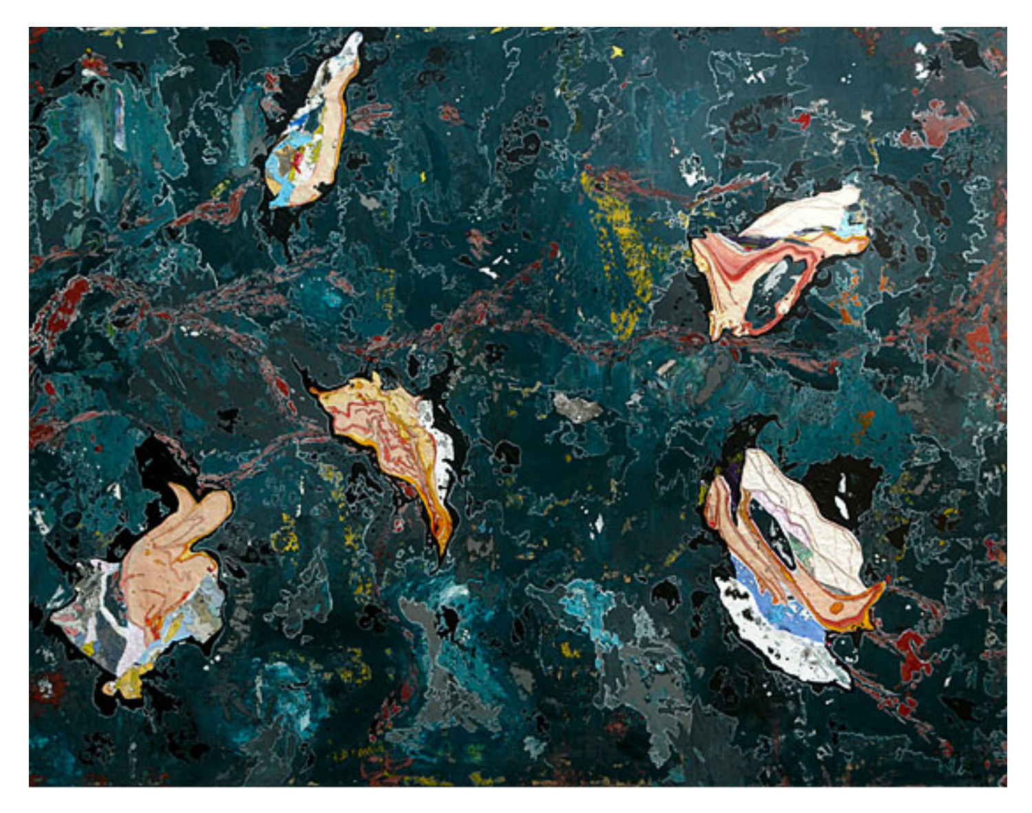
Drowning 48" x 36" - acrylics, ink and mixed media on wood