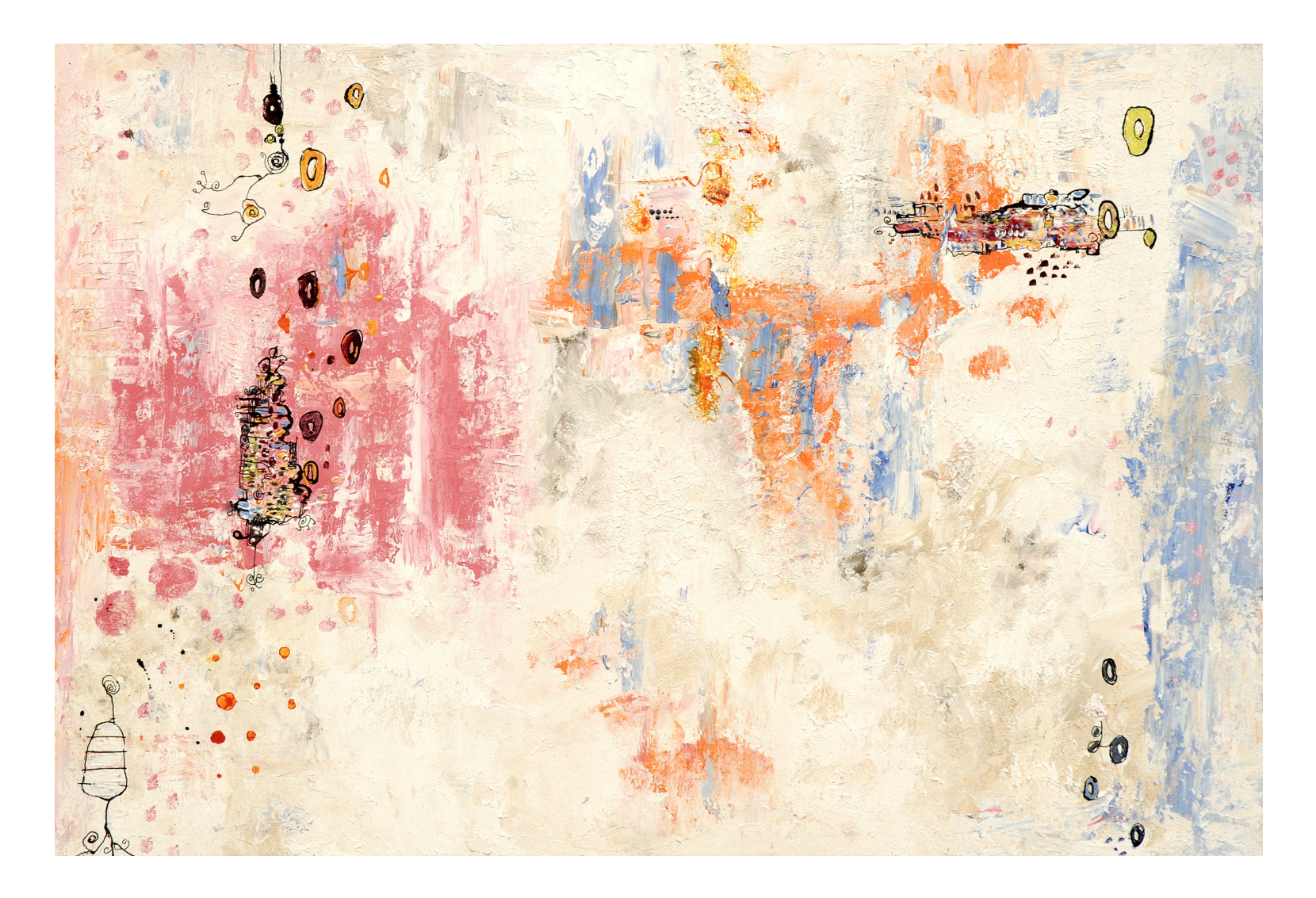
The Spaces in Between 36" x 24" - acrylics, ink and mixed media on canvas